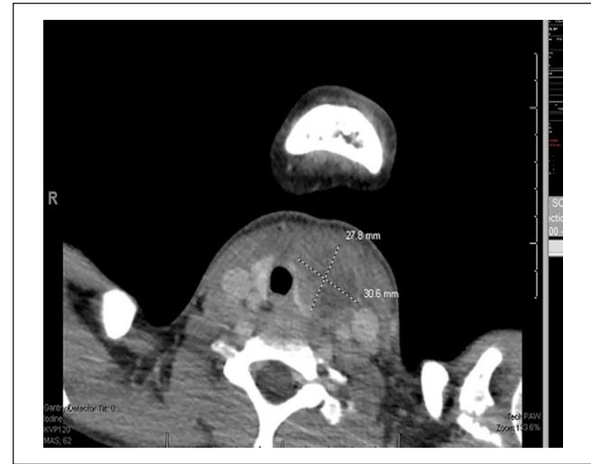
Image 1. CT neck showing heterogenous collection in the region of the left thyroid.

He was initiated on intravenous ampicillin-sulbactam with minimal clinical improvement. He was taken to the operating room for incision and drainage on day 4 of hospitalization, which resulted in a rapid clinical improvement in pain. Cultures of the drainage grew pan-sensitive Streptococcus anginosus , which is a bacterium commonly associated with oral flora. He was transitioned to amoxicillin-clavulanate to complete a 4-week course of antibiotics.