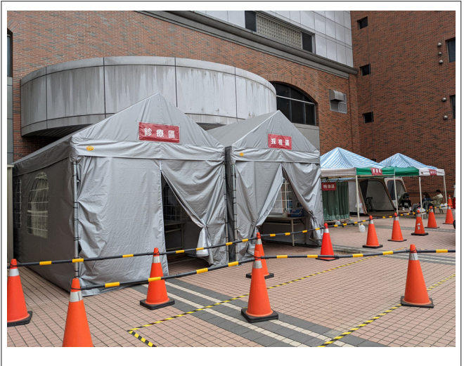
FIGURE 2 | Tents as "outdoor clinics".