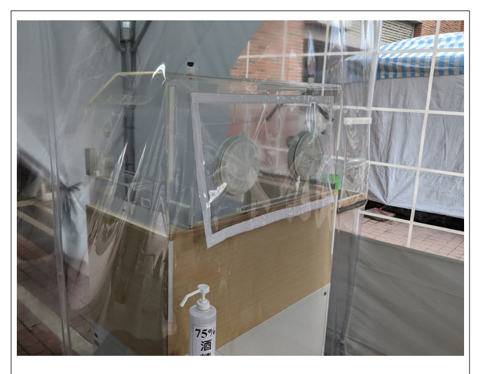
FIGURE 3 | Homemade "sampling shield" for nasal swab testing.