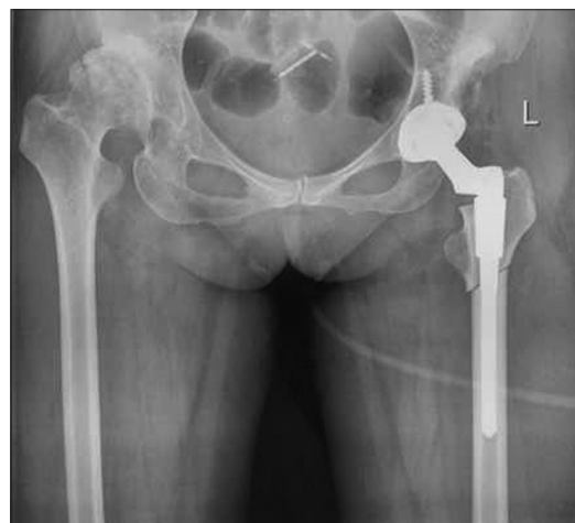
Figure 1: Immediate postoperative x-ray pelvis with proximal thigh and hip joint anteroposterior view showing subtrochanteric oblique osteotomy and total hip arthroplasty with S-ROM stem (case 17)

Subtrochanteric oblique ( n = 9 ) [Figure 1] or transverse ( n = 12 ) [Figure 2] shortening and derotational osteotomy was performed according to the technique described by Huo et al. 9 and Masonis et al. 18 respectively. Below the lesser trochanter 1 cm, the oblique osteotomy was performed using an oscillating saw from an inferomedial direction toward a superolateral direction at 45° to the longitudinal axis of the femoral shaft. If the osteotomy line was perpendicular to the femoral shaft axis, it became transverse osteotomy. Intraoperatively, the surgeon decided whether the osteotomy site should be augmented. If, at the end of the procedure, there was any sign of instability at the osteotomy site, it must be revised or additional fixation used; and there were other cases requiring more robust fixation, such as in young men. All the patients in the study had implantation of the S-ROM three-piece femoral component made of titanium alloy without cement. During the operative procedures, we did not explore nor palpate the sciatic nerve to evaluate tensions. The operation time and intraoperative blood loss were recorded.