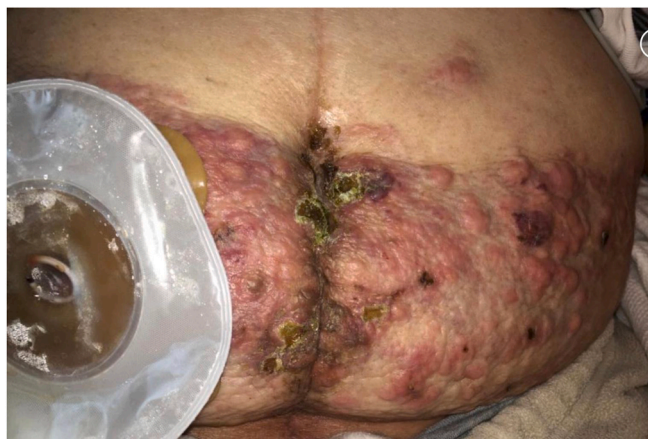
Fig. 1. Multiple cutaneous metastases on abdominal wall.