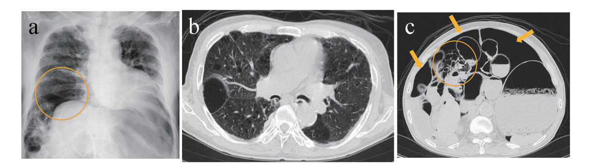
Figure 2. A chest radiography revealed decompression of the right lung with an elevated diaphragm and the retention of massive free air under the diaphragm (circle) (a). Non-contrast computed tomography revealed bilateral multiple emphysematous bullae in the lungs (b), distended small intestines, and intraperitoneal free air (arrows) along with multiple, small bubbly cysts beneath the intestinal serosa (circle) (c).

respiratory condition, he was intubated and admitted to the intensive care unit.