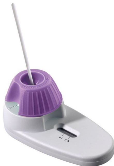
Figure 1. SavvyCheck™ Vaginal Yeast Test kit (picture used with permission of the manufacturer).

The SavvyCheck™ Vaginal Yeast Test (Savyon Diagnostics, Ashdod, Israel) was used as recommended by the manufacturer (Figure 1). This assay uses the concept of a lateral flow immunoassay system; the swab is therefore mixed with an extraction buffer liquid placed in a cap situated at the proximal end of the device for 20 s. To convey the liquid onto the test strip, the cap of the device is rotated 2 times. The probe then flows by capillary forces along the various strip components. The first immunologic interaction develops between the extracted yeast antigen and the anti- Candida polyclonal antibody conjugated to a colored bead, generating a colored antibody–antigen complex. The now newly assembled complex migrates to a second anti- Candida polyclonal antibody, which is adherent to the membrane at the test line. This second immunologic interaction generates a visual signal along the strip due to the formation of concentrated colored tags at this specific location. After 10 min, a blue line appears in the control region (C), confirming that the assay was performed correctly. At a minimal fungal load of 3 \times 10^3 , a blue line emerges in the test region (T), and the test can therefore be considered positive for VVC. In the absence of VVC, there is no line in the test region, and the test result is considered negative.