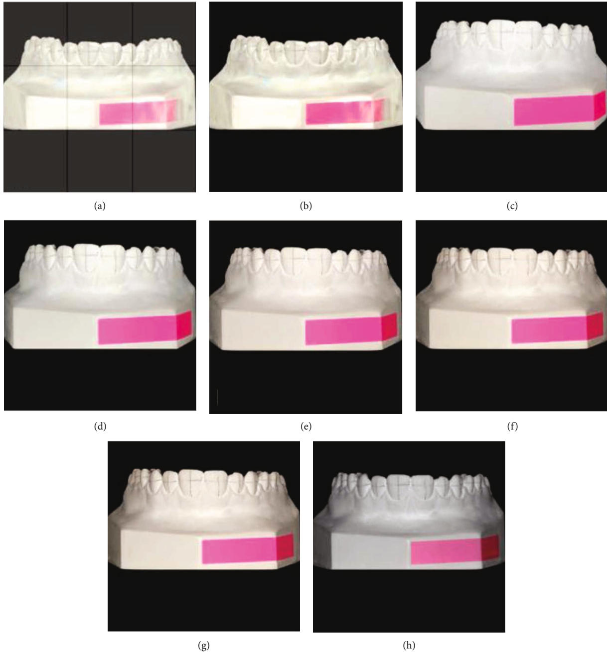
FIGURE 1: Photographs of the same model with the different camera devices. (a) Scan with grid lines to determine the positioning of the model. (b) Scan of the plaster model (dcm format to see the marked reference lines). (c) Photograph captured with iPhone X at 16 cm. (d) Photograph captured with iPhone X at 20 cm. (e) Photograph captured with iPhone X at 24 cm. (f) Photograph captured with iPhone X at 28 cm. (g) Photograph captured with iPhone X at 32 cm. (h) Photograph captured with Canon EOS 700D (100 mm macrolens).

100 mm macrolens) and five photographs that were captured using a smartphone (iPhone X) whereby the settings were the same (Figure 1).