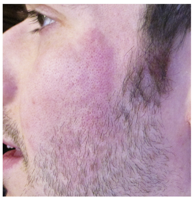
Fig. 4 The patient's left temple on the second day of his eruption.