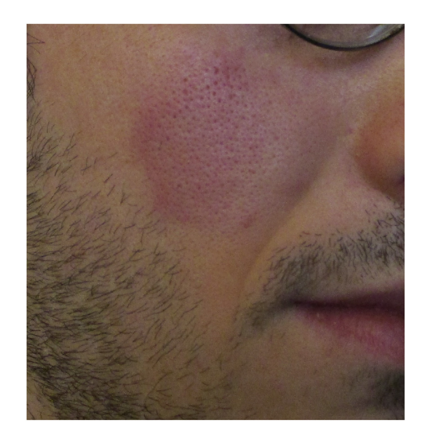
Fig. 2 The patient's right face on the first day of his eruption.