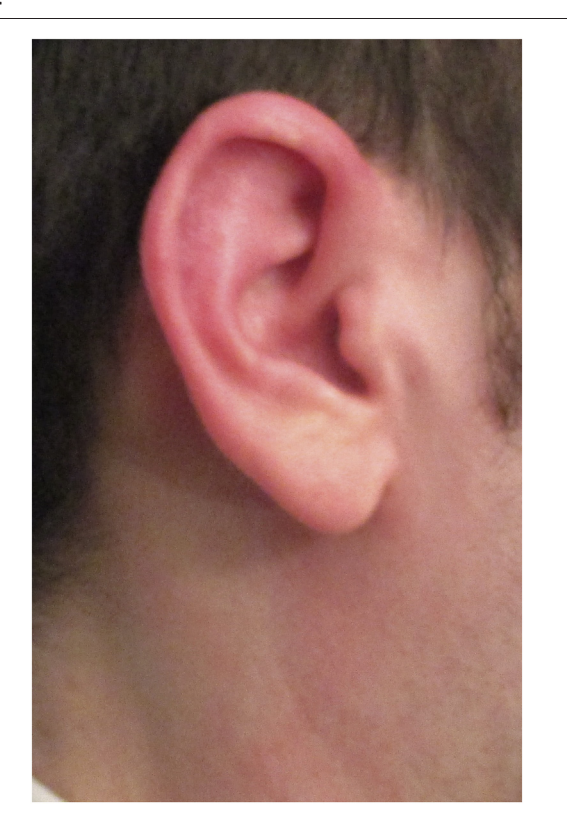
Fig. 6 Day three of the patient's eruption, now involving his right ear.