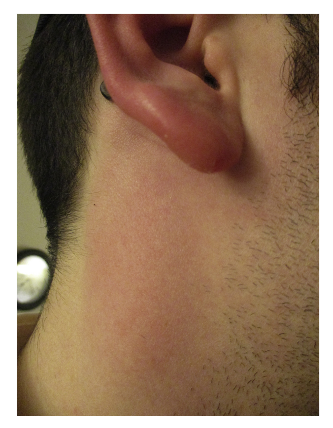
Fig. 7 Day five of the patient's eruption, now involving his right neck.