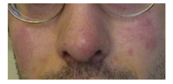
Fig. 1 The patient's mid-face on the first day of his eruption, front view.