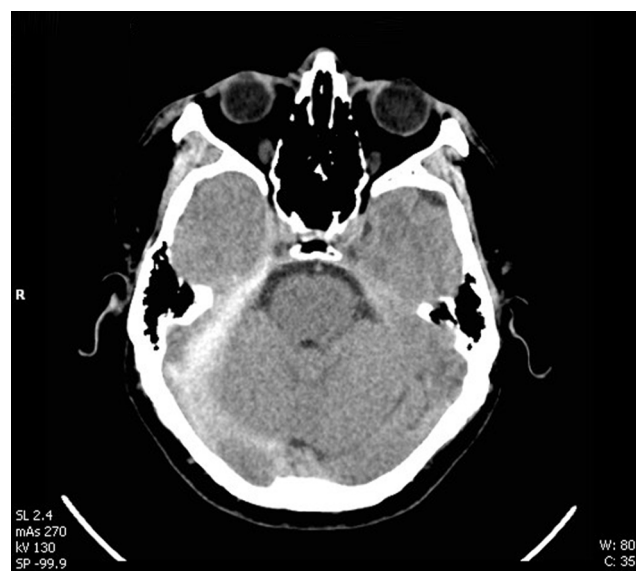
Figure 2 Noncontrast CT scan of the head prior to surgical evacuation (inferior section).