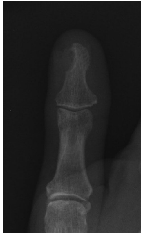
Fig. 2. Scalloping of distal phalanx of right thumb associated with overlying SCC.

In recent years, attention has focused on the association between subungual SCC and HPV infection. 4,5,7,17-20 Several studies have shown evidence of HPV infection in 60–80% of patients with subungual SCC. 4,17,18 In the case reported here, HPV was not detected in any of the tumors tested. In fact, the histological appearance was morphologically quite different from a subungual SCC excised from a different patient who was HPV positive. This correlates with reports that HPV-associated subungual SCC does not show benign features before becoming malignant. 7