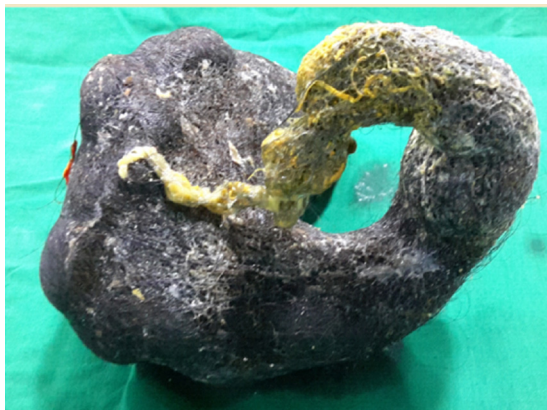
Figure 3: Specimen showing the removed trichobezoar casted in the shape of the stomach and the duodenum.

complications, recurrence and also allows screening for satellite lesions [15,16]. Due to the large size of the bezoar and the complications involved, endoscopic removal posed a higher risk as it was nearly impossible to fragment and remove the entire bezoar successfully. Intraoperatively, we noticed the bezoar tail obstructing the Ampulla of Vater, confirming our suspected diagnosis. Some cases of gastric trichobezoar can be managed laparoscopically as stated by Yau et al. as it allows for a shorter postoperative stay and a smaller scar, yet the risk of intrabdominal spillage and incomplete removal are concerns [16,17]. In the largest review of the management of trichobezoars, 100 of 108 patients (92.5%) were treated by laparotomy, with only a 12% complication rate making it the treatment of choice for trichobezoars especially in Rapunzel syndrome [15]. The