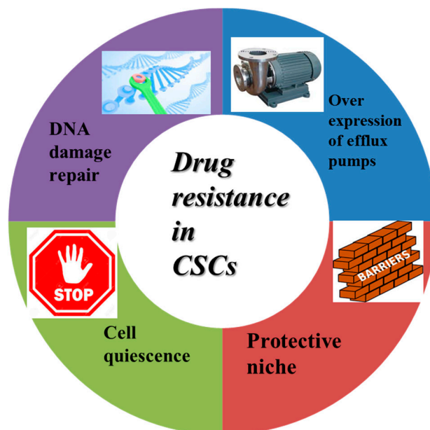
Figure 1. The related mechanisms of drug resistance in cancer stem cells. CSCs: cancer stem cells.