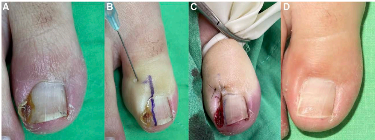
Figure 3. A case of complicated paronychia of the left big toe in a 59-year-old female with adenocarcinoma of the lung, involving right upper lobe and multiple metastasis; cT4N3M1c, stage IVB under targeted therapy with Giotrif (afatinib; Boehringer Ingelheim Pharmaceuticals, Inc., Ridgefield, CT) and shifted to Tagrisso (osimertinib; AstraZeneca, Cambridge, UK) due to intolerable side effects. (A) Pre-operative wound. (B) Infiltration using lidocaine without epinephrine via one injection into the surgical area. (C) Immediate post-operative wound (gloves combined with a mosquito clamp used as a tourniquet to prevent accidental retention of gloves). (D) Post-operative wound at 1 year after surgery.