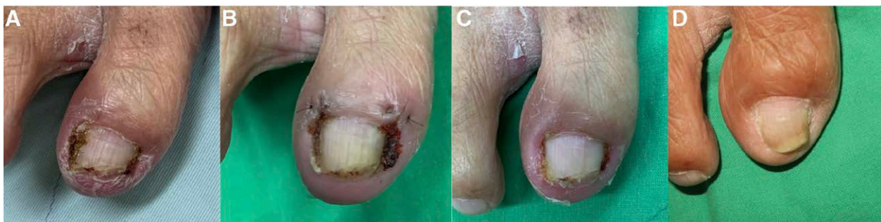
Figure 5. A case of complicated paronychia of the right big toe in a 64-year-old male patient with adenocarcinoma in the right lower lobe; poorly differentiated (papillary predominant), pT1bN0M0, stage IA2 with brain, bone, and liver metastases, under Giotrif (afatinib; Boehringer Ingelheim Pharmaceuticals, Inc., Ridgefield, CT) treatment. (A) Pre-operative wound. (B) Post-operative wound at 2 weeks. (C) Post-operative wound at 4 weeks. (D) Post-operative wound at 38 weeks.

Our study is limited by the small number of cases and the retrospective design that does not effectively represent the general population. Nevertheless, this study demonstrates the benefits of a common surgical procedure, such as partial matricectomy, which is routinely performed although rarely in this patient group. This efficacy of surgical partial matricectomy in the treatment of paronychia can pave way for further research to reduce