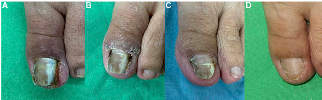
Figure 4. A case of complicated paronychia of the left big toe in a 75-year-old female patient with lung adenocarcinoma, involving the left upper and lower lobe and poorly differentiated with focal pleomorphic feature; pT4N0M0, stage IIIA under Iressa (gefitinib; AstraZeneca, Cambridge, UK) treatment. (A) Pre-operative wound. (B) Post-operative wound at 3 weeks. (C) Post-operative wound at 14 weeks. (D) Post-operative wound at 40 weeks.