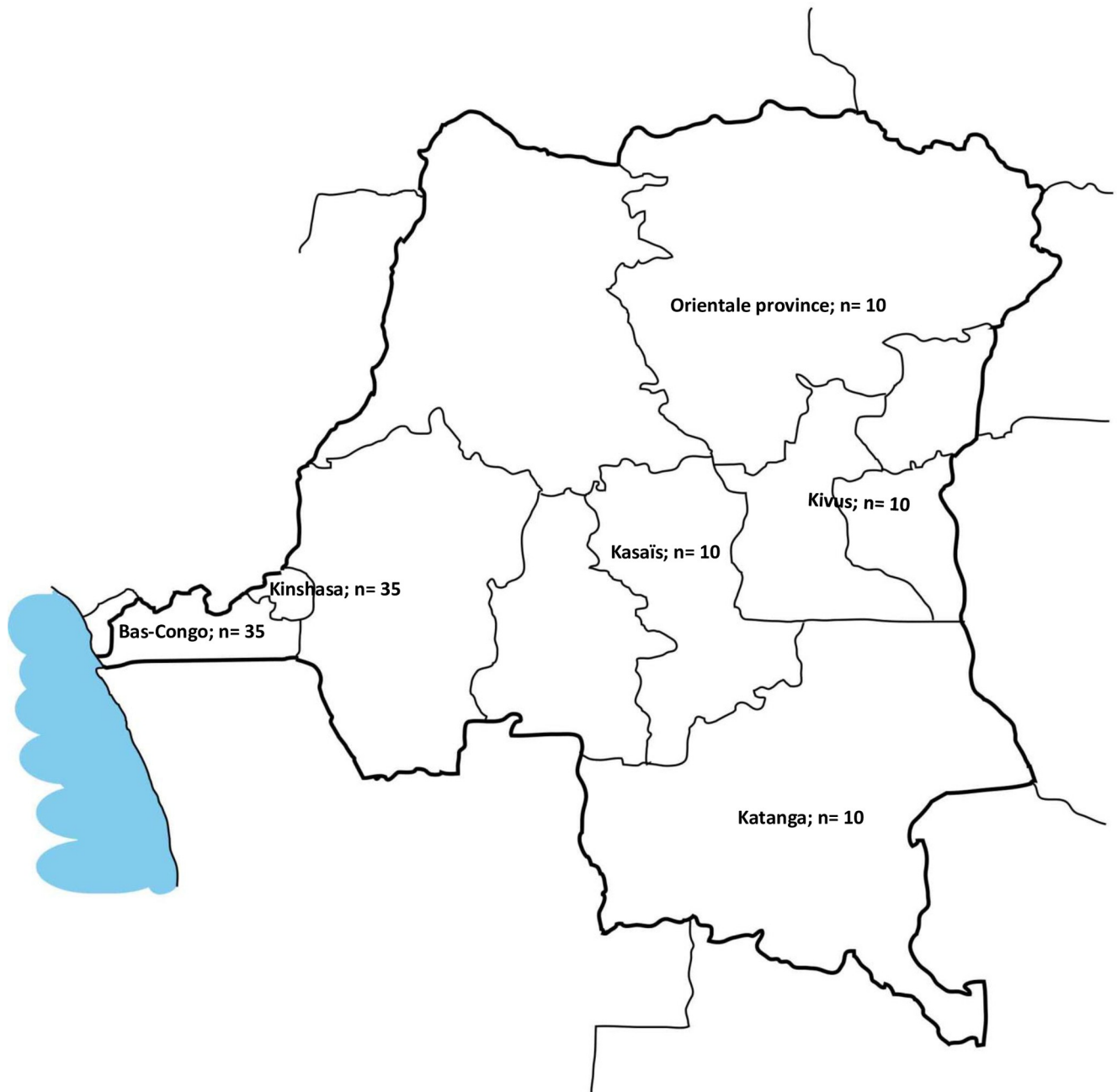
Fig 1. Map of DR Congo displaying the origins of the 110 participants. The participants were recruited from five regional blocks and the capital city (Kinshasa).

https://doi.org/10.1371/journal.pone.0241120.g001