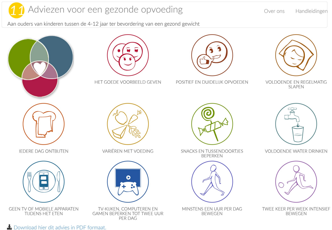
Fig 2. Screenshot of the web app “11 recommendations for healthy parenting”.

https://doi.org/10.1371/journal.pone.0231245.g002