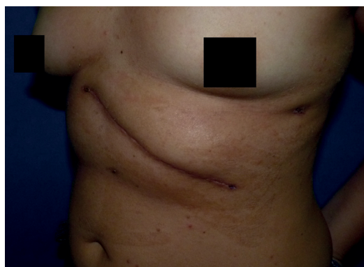
Figure 2 - Patient appearance in the sixth postoperative month. Note that the contour of the costal margin was maintained, being stable and symmetrical.