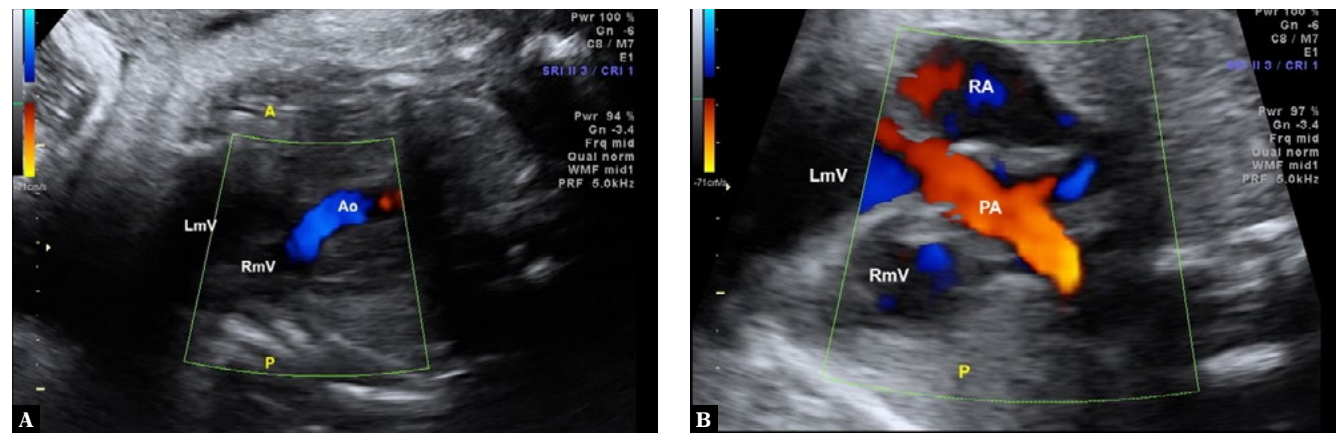
Fig. 2. Fetal echocardiography at 37 weeks of gestation showing the ventricular outflow tracts: A. the aorta artery arising from the right morphologically ventricle (left-sided ventricle) and B. the pulmonary artery arising from the left-morphologically ventricle (right-sided ventricle). Ao – aorta; PA – pulmonary artery; RA – right atrium; RmV – right morphological ventricle; LmV – left morphological ventricle; A – anterior; P – posterior

In cases of corrected transposition of the great arteries, the atrial situs is generally solitus with levocardia. However, dextrocardia and mesocardia are common in the cases of corrected transposition of the great arteries. Approximately 5% of patients with corrected transposition of the great arteries have atrial situs inversus, which includes significantly fewer complications than those with situs solitus<sup>(3)</sup>. In the cases of corrected transposition of the great arteries with situs solitus, there is a higher prevalence of Ebstein-like anomalies and congenital heart