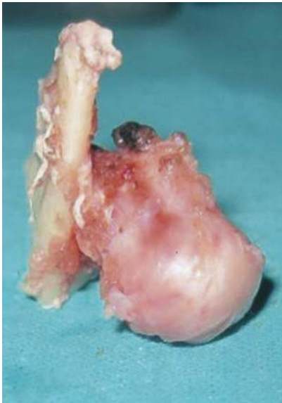
Fig. 4. The photograph of the surgical specimen shows a mushroom-shaped bony mass extending from the right coronoid process.