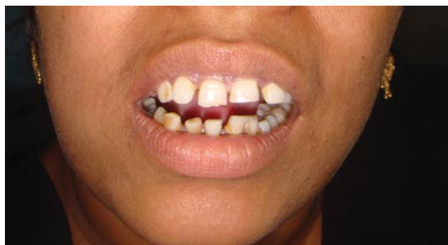
Fig. 1. Extra-oral photograph of the patient shows reduced mouth opening of 22 mm with deviation of the mandible towards the right side.