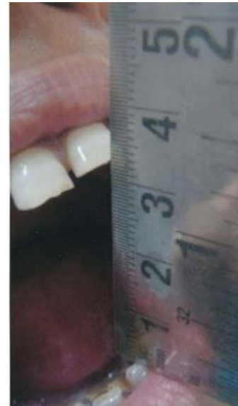
Fig. 6. One year post-operative follow-up shows a mouth opening of 35 mm.