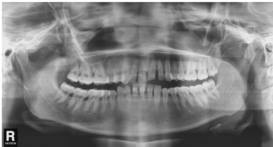
Fig. 2. Panoramic radiograph shows a radiopaque mass extending medially from the right coronoid process.