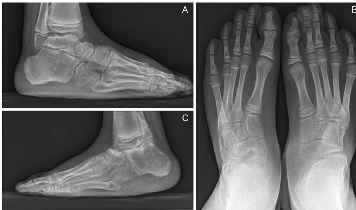
Fig. 3 Non-idiopathic bilateral clubfoot secondary to arthrogryposis at 12-year follow-up. Fair result (worst ICFSG of the cohort: 23). A talectomy was performed 7 years after the first surgery on the left side

The rate of surgery (39 %) was high after the FFM in the present study. As demonstrated by Chotel et al., the FFM may be less efficient than the PM [40]. Conversely, Richards et al. showed that both techniques have a similar rate of residual deformities (94.4 and 95 % of initial