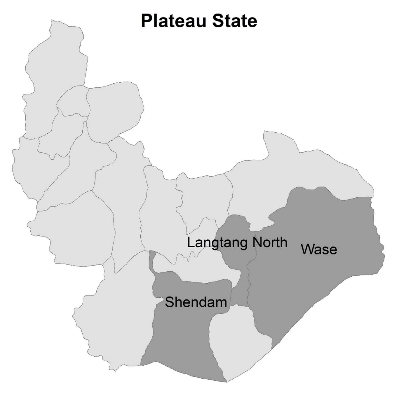
Figure 2. Map of Local Government Areas (LGAs) surveyed. doi:10.1371/journal.pntd.0001995.g002

was assessed. The prevalence difference of participation was also calculated for the subset of the households where the head of household reported having received antibiotics for trachoma from a CDD.