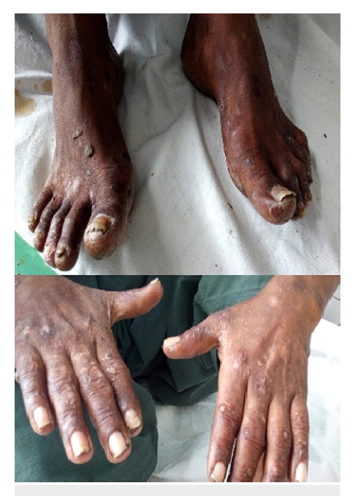
FIGURE 1: Skin lesions.

His neurological examination revealed a Glasgow coma scale (GCS) of 9/15 and bilaterally upgoing plantars. There were no signs of meningeal irritation or cerebellar damage. Sensory system was intact and the back examination was unremarkable. Motor examination showed normal bulk in all four limbs, increased tone in all four limbs, power of 3/5 and hyperreflexia in all four limbs.