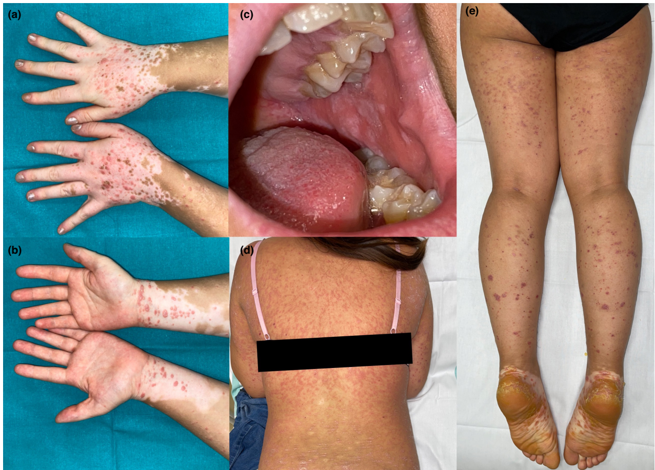
Figure 1 COVID-induced LP. (a, b) LP lesions on depigmented areas of both hands, (c) Reticular white plaques on oral mucosa. (d, e) LP lesions on normal skin of trunk and extremities.

Considering the clinical and histopathological findings, and the onset and worsening of the skin eruption in relation to the COVID-19 vaccine, diagnosis of vaccine-induced LP was rendered.