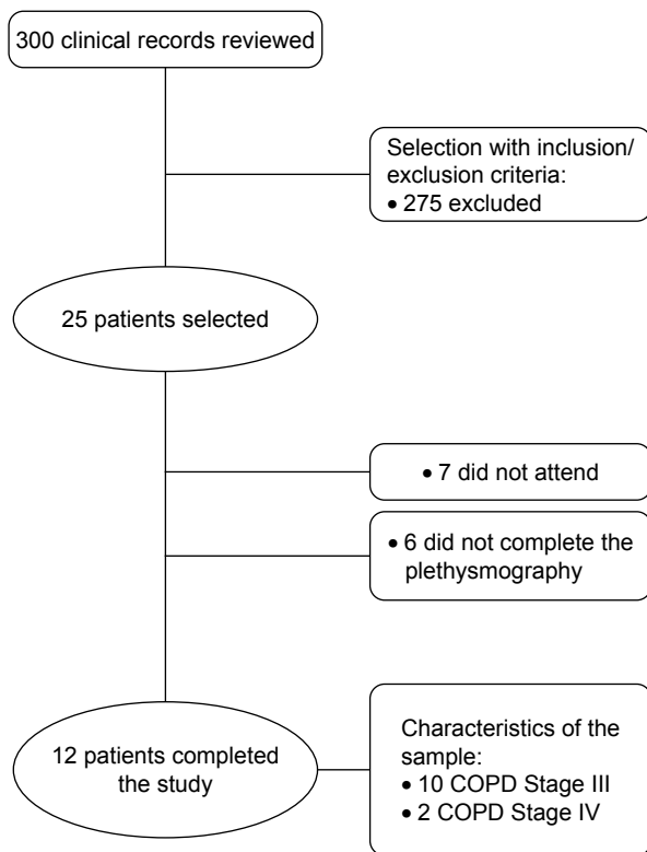
Figure 1 CONSORT flow diagram.

Abbreviation: COPD, chronic obstructive pulmonary disease.