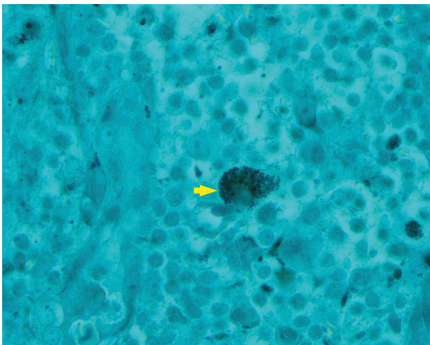
FIGURE 2: Toxoplasma gondii bradyzoite as demonstrated by GMS stain (x100 magnification).