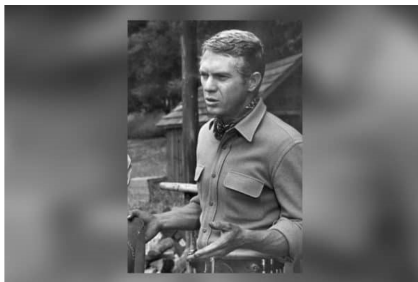
Figure 2. The well-known American actor, Steve McQueen, died of mesothelioma in 1980 at the age of 50. McQueen's first exposure to asbestos likely occurred during his service in the U.S. Marine Corps from 1947 to 1950. Through his service, McQueen spent time working onboard naval ships and in the shipyards.