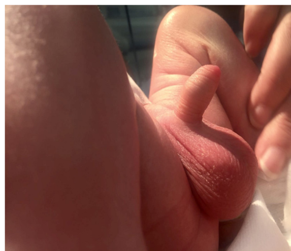
Fig. 1 Neonatal priapism: neonatal priapism in our newborn

Below we discuss the principal features of neonatal priapism cases found on Medline from 1974 [23] to 2018, using priapism, newborn, neonatal priapism, persistent penile erection as key words.