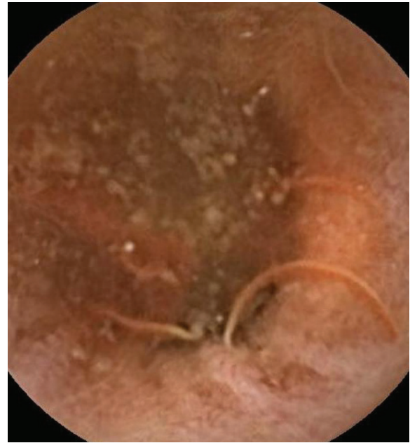
Figure 2 Small bowel videocapsule endoscopy (PillCam SB 2, Given Imaging, Israel, magnification x8) showing larvae of worm ( Strongyloides stercoralis ) within the ileal fluid, entering the ileal mucosa

second, careful reading of the video we noticed larvae lying on (Fig. 1), or entering (Fig. 2) the small bowel mucosa. Our patient had no risk factors for infection. She had never traveled abroad, was tested HIV and HTLV-1 negative and had not received corticosteroids.