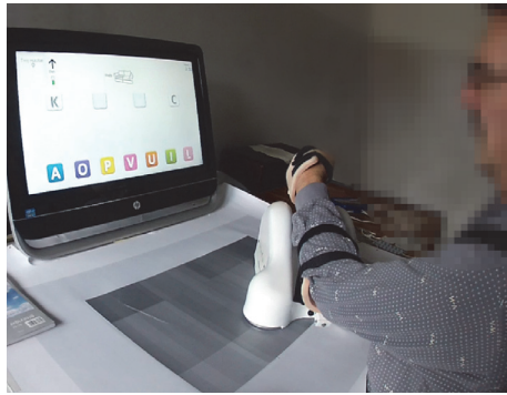
FIGURE 1: ArmAssist training.

physiotherapy. Occupational therapy for the paretic upper limb included passive stretching within submaximal ranges of motion to inhibit spasticity, active-assisted movements, functional tasks, and activities of daily living, all progressed individually. Physiotherapy consisted of range of motion exercises for upper and lower extremities, gentle stretching, splinting/casting, facilitation of active voluntary movement, and exercises to improve endurance, balance, strength, and gait. If necessary, speech therapy was provided three to five times per week.