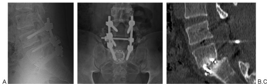
Fig. 4 (A) Lateral and (B) anterior-posterior radiographs at postoperative month 6. (C) Computed tomography revealed solid interbody fusion between L5–S1 levels. The patient’s fecal and urinary incontinence improved 6 months after discharge. He has been pain-free for a year and has returned to work.

Although there has been no biomechanical study to explain the pathomechanism of traumatic spondyloptosis, the injury tends to happen when a force is applied to the lumbar spine, especially when the pelvis and sacrum are in a fixed position. 10,14 However, Saiki et al reported in their review that hyperextension can lead to anterior lumbosacral dislocation if there is a preexisting spondylolytic lesion at L5. 12 In our case, we believe that the mechanism of injury was a sudden posterior-to-anterior force applied by a big tree trunk.