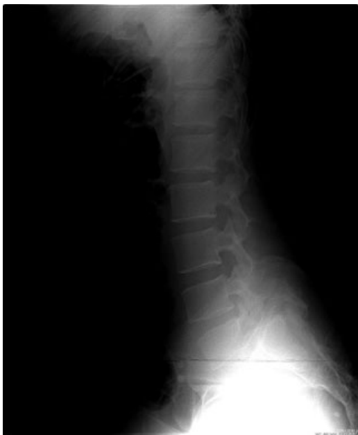
Fig. 1 Lateral radiograph of lumbar spine demonstrating spondyloptosis of L5 over S1.

Radiologic workup was obtained including radiographs, magnetic resonance imaging, and computed tomography. Plain radiographs suggested L5 spondyloptosis with regard to S1 (► Fig. 1 ). Computed tomography demonstrated double vertebral arch (► Fig. 2 ), and magnetic resonance imaging suggested almost complete dural sac obstruction between L5 and S1 levels as well as disrupted disk space (► Fig. 3 ).