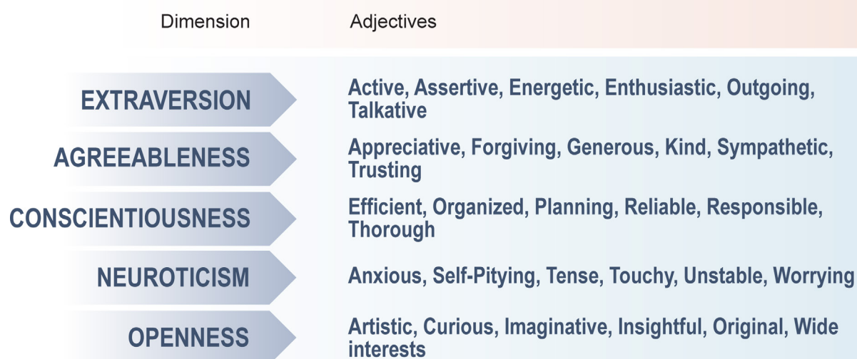
Figure 1 Personality dimensions of the Five Factor Model and their descriptors according to McCrae and John. 30

(figure 1). The present investigation assesses a large, multinational sample of trained or training physicians, using the FFM to describe the profiles of surgical and medical specialties across levels of training.