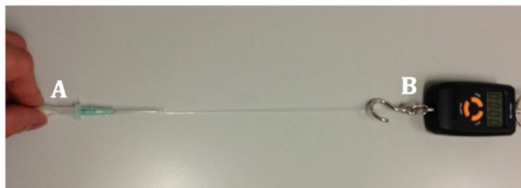
Figure 2 Setup up to indirectly measure static friction by recording the force required to displace the catheter away from the needle. Consisting of A : intravenous cannula; B : electronic spring scale.

values in each group were compared by a two-tailed, unpaired heteroscedastic Student's t -test. P values of < 0.05 were considered statistically significant. Variance was reported by using standard deviations (SD), relative standard deviations (RSD) and 95% confidence intervals (95% CI).