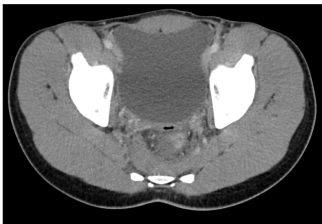
Figure 2 CT image (axial view) demonstrating air in the perirectal space secondary to a right gluteal stab wound.

Colostomies in patients experiencing traumatic injury are associated with stoma-related complications, as well as psychosocial burden and reduced quality of life. 9 As such, avoiding unnecessary stomas is important to patients. To avoid pelvic sepsis, diverting stomas certainly have a role in more extensive