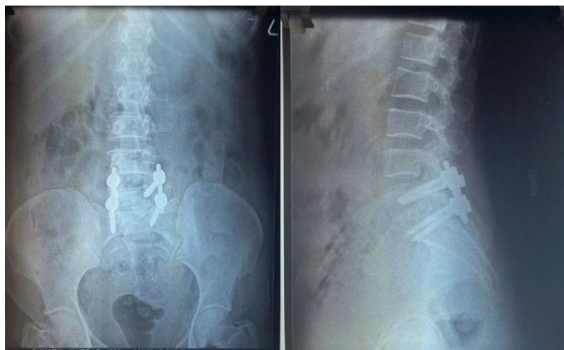
Figure 3: Illustrative case of Grade 2 degenerative spondylolisthesis treated with transforaminal lumbar interbody fusion with pedicle screw stabilization.

patients using an Oswestry Disability Index (ODI) Assessment Questionnaire. The patient’s pain perception was noted on visual analog scale (VAS) and numerical rating scale (NRS) scores, and the degree of pain relief was assessed by the PRR score. VAS is a 10 cm scale (scored as “10” = worst pain imaginable and “0” = no pain), NRS has endpoints “0” (no pain), and “10” (worst pain imaginable). Pain Relief Rate: “< 25%” = unrelieved, “25–49%” = mere relief, “50–74%” = moderate relief, “75–99%” = significant relief, and “100%” = complete relief) was also assessed. VAS score, NRS score, and ODI score were assessed preoperatively, 3 months, and 12 months postoperatively, and PRR was assessed at 3 months and 12 months postoperatively.