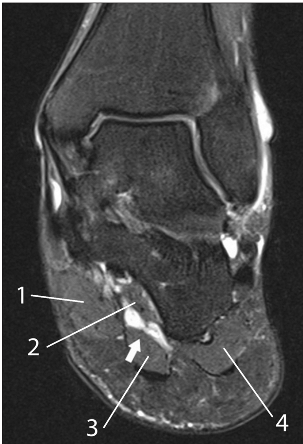
Figure 4: MRI of the left foot in a normal patient for comparison. Coronal reformatted T2-WI showing clearly the hyperintense medial plantar veins (arrow) in normal conditions. The veins are surrounded by the m. abductor hallucis (1) medially; the m. quadratus plantae (2) deeply from the veins; and the m. flexor digitorum brevis (3) laterally. The muscle belly of the m. abductor digiti minimi (4) is located at the lateral plantar aspect of the foot.

of our knowledge, there are no known cases of plantar vein thrombosis resulting from wearing inappropriate footwear. In our case, a possible explanation for the plantar vein thrombosis is venous stasis of blood and local trauma caused by the hump on the inner sole of the shoe of the patient.