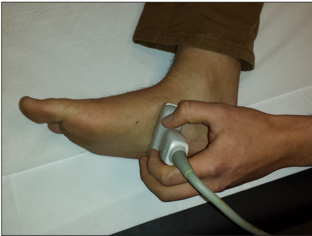
Figure 3: Position of the ultrasound probe for visualization of the medial plantar veins in a coronal plane. To visualize the medial plantar veins in a sagittal plane, the probe is turned 90° in a longitudinal direction on the foot.