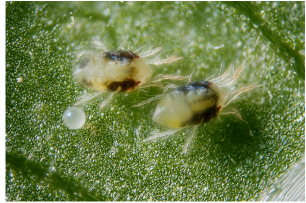
Figure 1. Two females and one egg of the two-spotted spider mite ( Tetranychus urticae Koch; Acari, Tetranychidae).