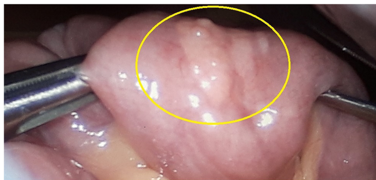
Fig. 2 Intraoperative videolaparoscopic image of heterotopic pancreas on the jejunum (circle)

Eight patients (58%) were diagnosed with type I heterotopia: two patients had the heterotopic pancreas in the gastro-pyloric area, three patients in the small bowel, two patients in the Meckel's diverticulum and one in the duodenal duplication. One patient (7%) was diagnosed with type II heterotopia in the small bowel. Two patients (14%) had heterotopic pancreas with diffuse necrotic and hemorrhagic alterations in the Meckel's diverticulum; in both patients, heterotopic tissue was found incidentally during urgent surgery for mechanical complications of the Meckel's diverticulum. Of interest, three patients (21%) presented with associated gastric and pancreatic heterotopia, two in the Meckel's diverticulum and one in