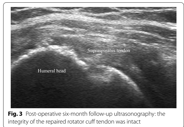
Fig. 3 Post-operative six-month follow-up ultrasonography: the integrity of the repaired rotator cuff tendon was intact

rotation at 90° of abduction, and L4 vertebral level for internal rotation to the posterior). On follow-up ultrasonography, the integrity of the repaired rotator cuff tendon was intact (Fig. 3), but osteonecrosis could not be confirmed due to the lack of plain radiography. The inflammatory markers estimated to detect infection were within normal ranges. Conservative treatment including NSAIDs and stretching exercises was continued, and 1 year after surgery, the left shoulder pain decreased (VAS score pain at rest: 1, pain during activity: 3); however, follow-up plain radiography and MRI showed osteonecrosis of the humeral head (Fig. 4a, b, c). The repaired rotator cuff tendon showed insufficient thickness, but no discontinuity (Sugaya classification type III) (Fig. 4d). Shoulder range of motion was similar to the time after six months of surgery as follows: 140° for active forward flexion, 30° for external rotation at the side, 70° for external rotation at 90° of abduction, 50° for internal rotation at 90° of abduction, and L2 vertebral level for internal rotation to the posterior.