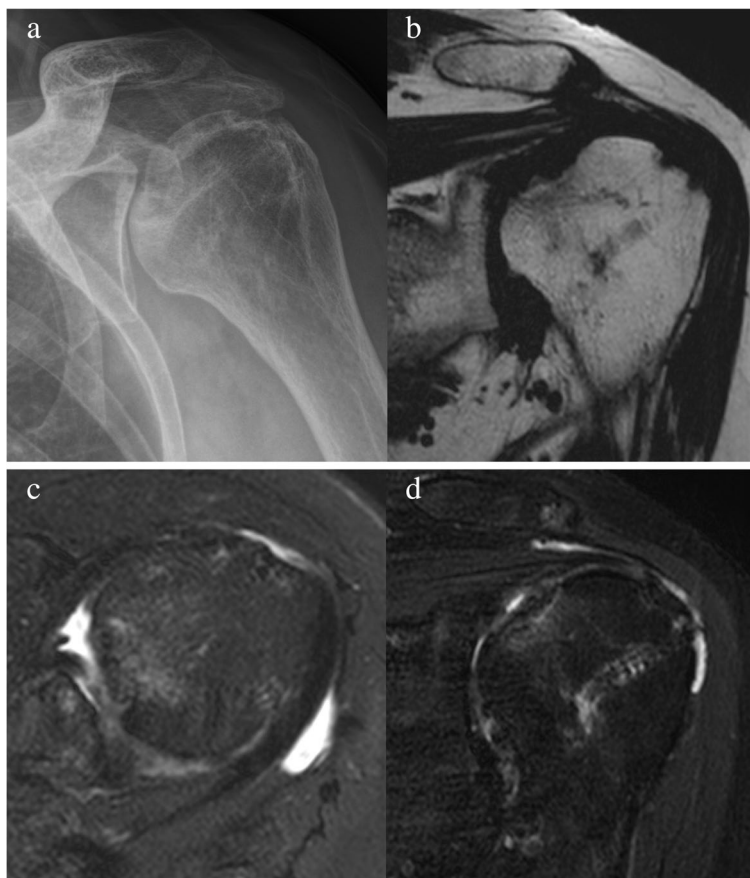
Fig. 4 a, b, c Post-operative one-year follow-up plain radiography and MRI; osteonecrosis of the humeral head on the superomedial side can be seen in the T1-weighted coronal and T2-weighted axial view d in the T2-weighted coronal view, the repaired rotator cuff tendon shows insufficient thickness although discontinuity is not visible (Sugaya classification type III)