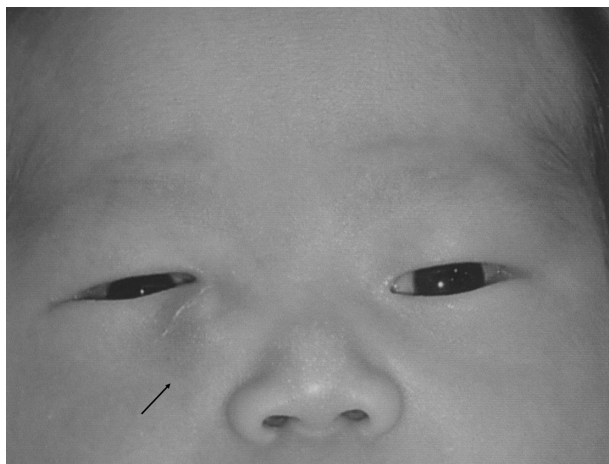
Figure 1 Image showing a large dacryocystocele causing an upward tilt of the inner canthus of the right palpebral fissure (arrow) in patient 1, a 5-day-old male infant.

A male infant with a dark-blue soft mass in the region of both lacrimal sacs at birth was examined by a local doctor at 2 days of age. He was healthy during the perinatal period and had no other complications. When we saw this case in our hospital at 10 days of age, the parents reported that the mass in the right lacrimal sac had disappeared at 7 days of age with no signs of mucoid fluid reflux from the right punctum or other symptoms. We followed the mass in the left lacrimal sac with a conservative treatment protocol with a continuation of topical antibiotics (tobramycin) prescribed by his local doctor. At 83 days of age, the left dacryocystocele was found to be reduced, with a retrograde reflux of clear mucoid fluid from both the superior and inferior puncta dur-