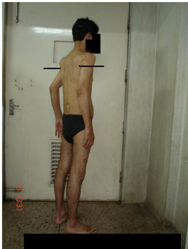
Figure 1 Wasting of the muscles around the shoulder joint.

On investigation, a full blood count, liver and renal function tests, serum calcium, phosphate, and creatinine phosphokinase were within the normal ranges. Roentgenogram of the lumbar-sacral spine, thigh, knee, chest, shoulder and cervical spine showed multiple soft tissue calcifications with hyperdensity of muscles (Figures 3, 4). There was no articular abnormality. Electromyographic examination of muscles was normal. Muscle biopsy showed atrophy with features suggestive of neurogenic involvement without active inflammatory signs.