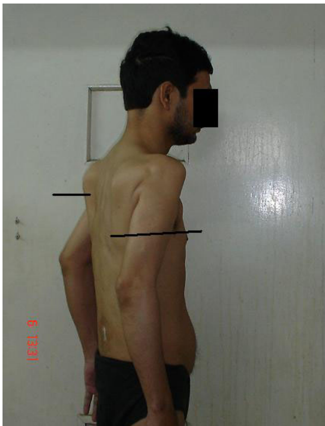
Figure 2 Wasting of the muscles around the shoulder joint (magnified view).

tions [3,4], with their patients presenting with woody induration of muscles with secondary contractures.