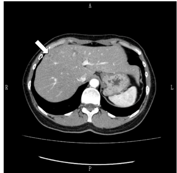
Figure 3. Follow-up enhanced abdominal CT findings of a 46-year-old woman with fascioliasis after 1 year of treatment. The multiple nodular cysts observed at admission are almost no longer visible (the white arrow).

fascioliasis. Therefore, the disease can sometimes be excluded from differential diagnosis and overlooked. 6,7