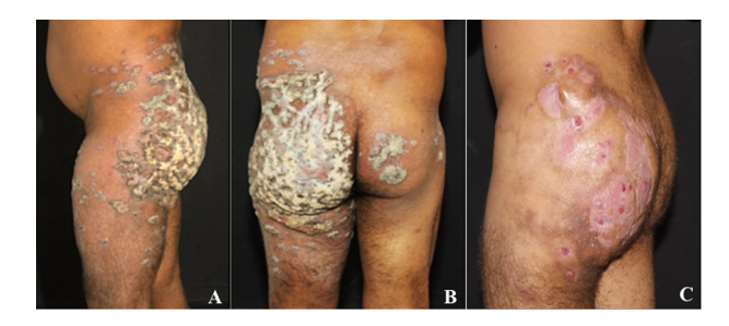
Fig. 1-A 26-year-old male farmer presented a verrucous plaque in the left side of the buttock (A), that spread to the right one (B). A marked improvement of the skin lesions caused by M. tuberculosis was observed after treatment, performed with rifampicin, isoniazid, pyrazinamide and ethambutol during six months.

A 26-year-old male farmer, residing in Belém, Pará State, Brazil, presented to the outpatient service of Dermatology