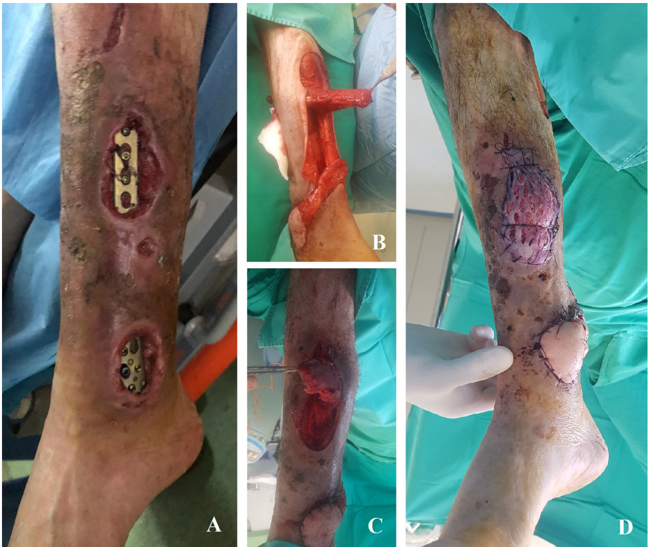
Figure 1: Hemisoleus flap used for the coverage of the defect located at the middle third of the calf A. Preoperative aspect; B. Dissected medial hemisoleus muscle flap; C. Tunneling the muscular flap; D. Immediate postoperative aspect.

The hemisoleus muscle flap represents a durable solution to cover the soft-tissue defects, especially in the lesions associated with bone exposure after the healing