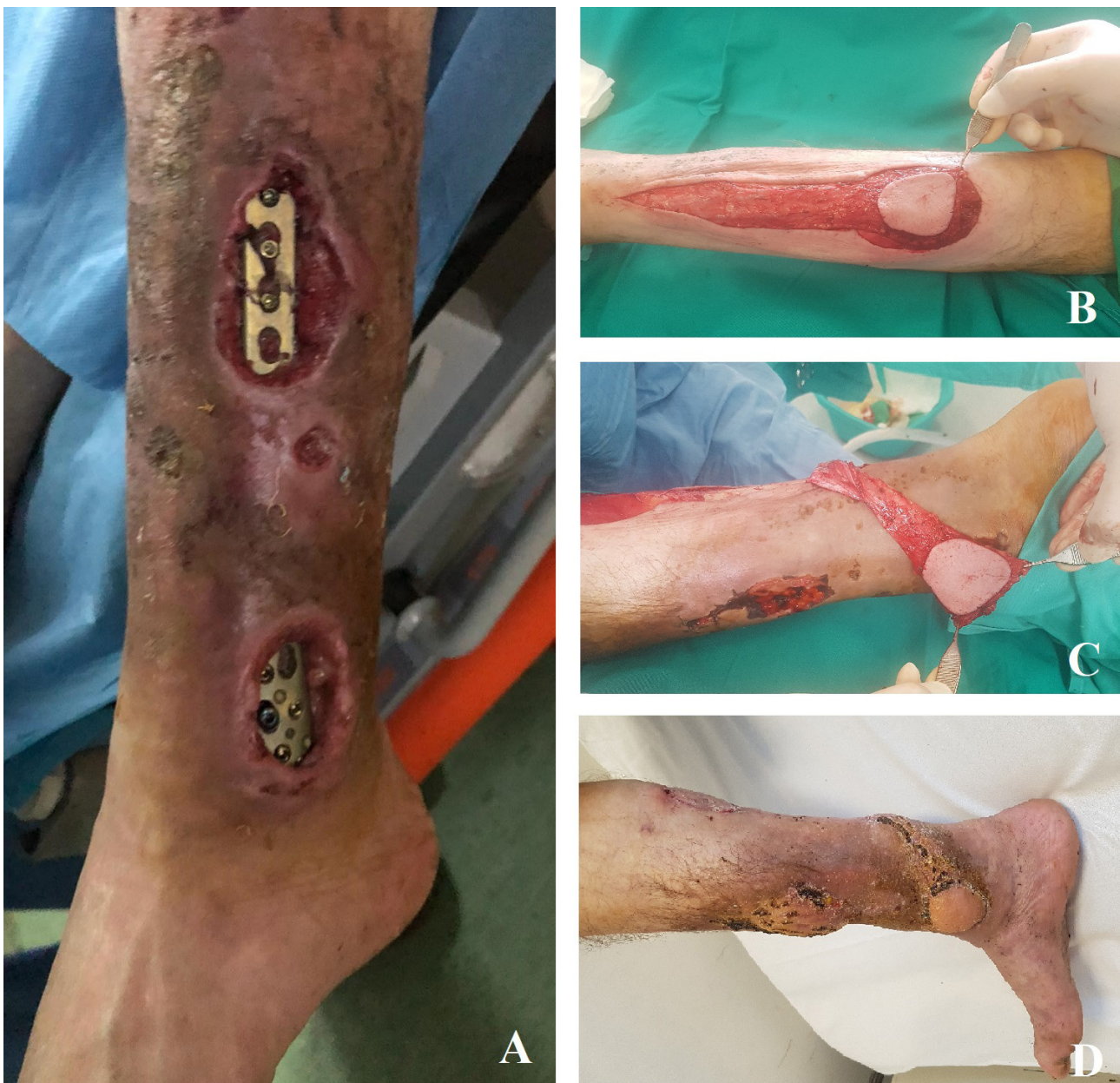
Figure 2: Sural flap used for the coverage of the defect located at the inferior third of the calf