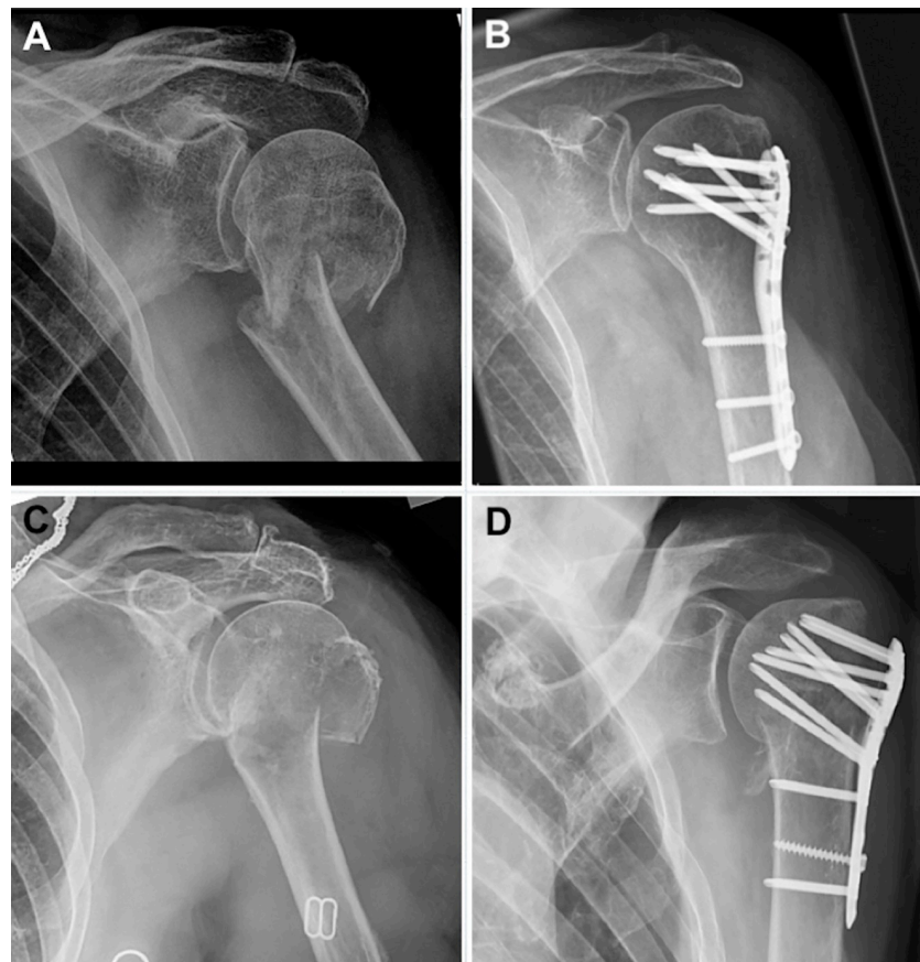
Fig 1. AO 11-A3 fractures before and after ORIF by locking plate. (A)+(B): fracture of a 69 years old female with postoperative anatomical fracture reduction = Inclusion criteria. (C)+(D): fracture of a 72 years old female with postoperative varus malreduction of the humeral head = Exclusion criteria.

Overall anatomical and acceptable fracture reduction was achieved in n = 265 (95.3%) of the patients. Radiographic evaluation of early postoperative radiographs revealed that n = 248 (93.6%) of the patients had primary anatomic reduction, [TS] 87.9% [STS] 91.2% [SS] 96.5%, p < 0.001 [SS] vs. others. In N = 17 (6.4%) cases minor head-shaft alignment was noticed with an overall acceptable reduction. In 13 cases (4.7%) fractures were malreduced and early revision osteosynthesis was performed. Between groups distribution was [TS] 6.8%, [STS] 5.5% and [SS] 1.2%, p < 0.001 [SS] vs. others. (Figs 1 and 2).