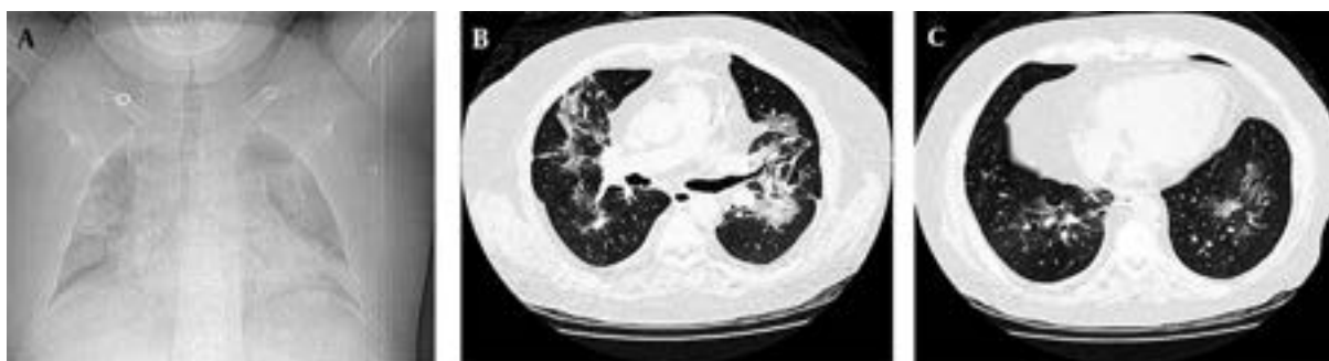
Figure 1. Chest X-ray and CT Section Images Results

A. CXR of diffuse bilateral perihilar opacity with extension to periphery of upper and lower lobes; B, C. CT section images, bilateral perihilar alveolar ground glass opacity with extension to periphery of the upper and lower lobes.