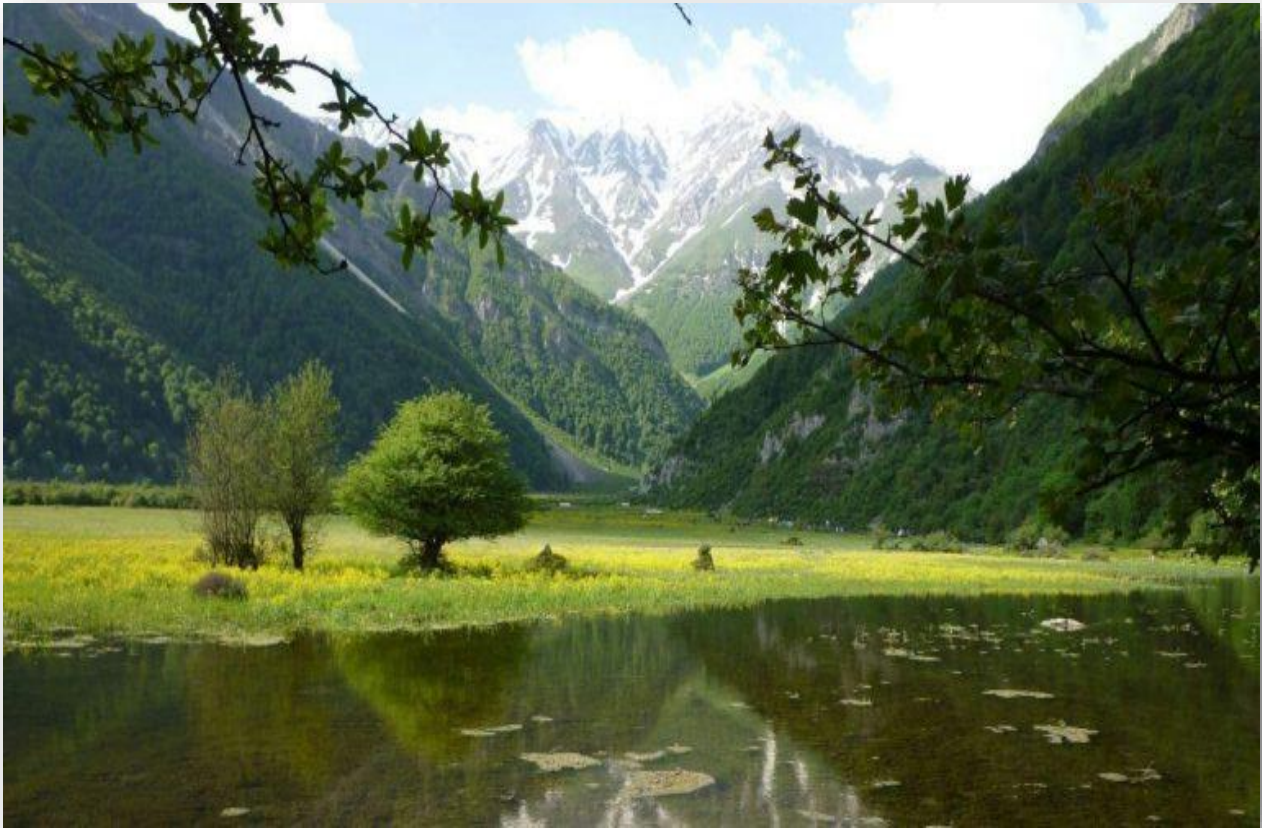
Daryasar Plain, Tonekabon, Mazandaran, Iran.