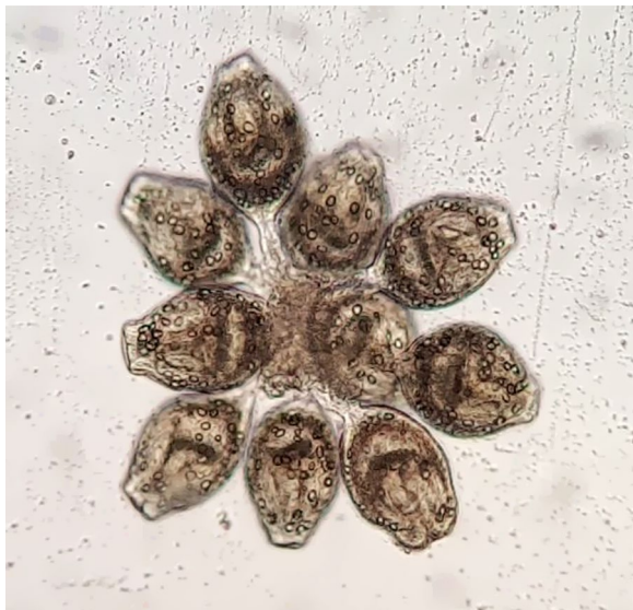
Fig. 3 Cluster of protoscoleces of E. granulosus collected from cyst fluid

secondary cysts. However, some hydatid cyst cases can be eradicated by repeated surgeries over several years [15].