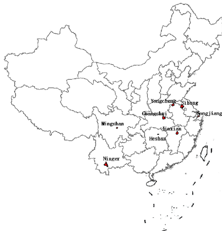
Figure 1 The sentinel sites in this study.

Two insecticides were tested: 0.25% deltamethrin and 4% DDT. Insecticide papers were obtained from the WHO reference centre in Malaysia [7]. Each batch was tested on the insecticide susceptible Jiangsu strain of Anopheles at the key laboratory in National Institute of Parasitic Diseases, Chinese Center for Disease Control and Prevention before dispatch to the participant provinces. Any batches of papers showing less than 100% mortality in these control tests were discarded. Each paper was used a maximum of six times. About 100 mosquitoes (3-5 replicates of approximately 25 mosquitoes, with tests performed over more than one day) were exposed to each insecticide for 1 hour. Mortality was recorded 24 hours after exposure. Each day a control was tested alongside the exposure tubes. The bioassay result was corrected using the Abbott formula when the control mortality was between 5 and 20%. The bioassay results were summarized in three resistance classes as defined by WHO: (1) susceptible when mortality was 98% or higher, (2) possible resistant when