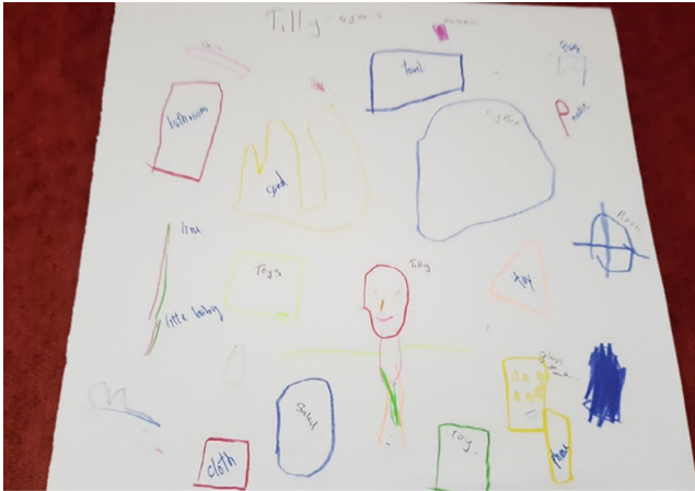
FIGURE 1 Tilly's drawing

We wondered if this was because she was unable at times to eat due to the side effects of nausea and vomiting from her chemotherapy. Along with favourite foods, there are named images of a bathroom, a towel and drinking cups that may represent her personal care due to illness. We noted that the range of imagery in her drawing presented the dimension of temporality (past, present and future) with an emphasis on eating food in the FG.