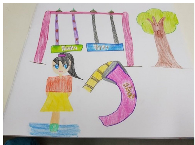
FIGURE 10 Kitty's drawing