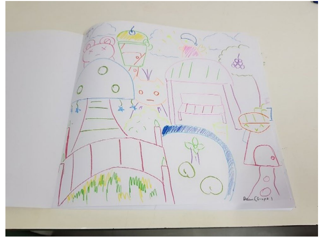
FIGURE 5 Grape's drawing

This angel has magic and can get rid of my illness so that I can eat whatever I like. Before I became unwell with diabetes, I could do everything and eat everything that I