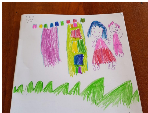
FIGURE 8 Elsa 2's drawing

The FG represented for Tilly a place of play and fun with items relevant to her at her age. We also note from our observations that Tilly really engaged and immersed herself in the FG and she was very eager to show things in the garden that she liked, that