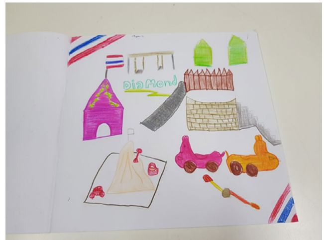
FIGURE 6 Diamond's drawing

liked. I could be like a normal teenage girl. Now I have lost my lovely lifestyle of eating sweet food.