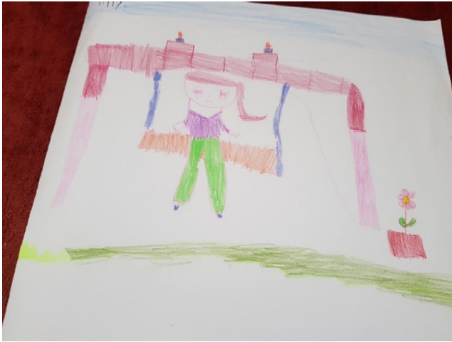
FIGURE 11 Pippy's drawing