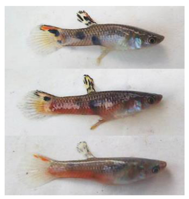
Fig 1. Standard (top), fully red (mid) and partially red (bottom) morph of P. picta from Georgetown, Guyana.