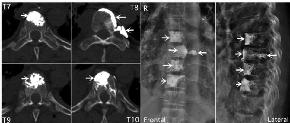
Figure 3. Postoperative CT and X-ray images showing most PMMA located in the vertebral bodies, with very slight leakage outside T8, but not into the spinal canal

she experienced movement and sensory disturbances to both lower extremities, which became progressively worse. After 15 minutes, the patient presented with complete absence of sensation and muscle strength below the costal arch and in both lower extremities (manual muscle testing, 0/5), decreased muscle tone, unsuccessful elicitation of tendon reflex, and relaxation of the anal sphincter. However, she showed no negative pathological signs such as Babinski, Oppenheim, Gordon, or Chaddock sign, and her heart rate, blood pressure, and SpO 2 were normal. Emergency thoracolumbar computed tomography (CT) confirmed very slight leakage of PMMA outside T8, but not into the spinal canal (Figure 3). In case of spinal concussion, the patient was treated with 200 mg of methylprednisolone intravenously. The muscle strength in her lower limbs gradually increased 2 hours later and the sense of pain and tenderness below the costal arch and in her lower limbs began to recover. Her movement and sensation had returned to normal after 4 hours and the patient was able to walk unaided and without discomfort on the first day after surgery. She was